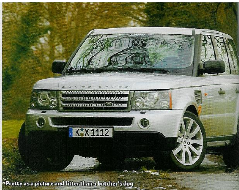
"Pretty as a picture and fitter than a butcher's dog"