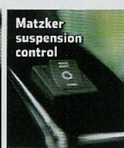
Matzker suspension control

The sensation of speed is quite disarming. It's only when your windscreen is suddenly full of blurred hedgerow and chevrons that you realise quite how fast you're going. It's at moments like this that you appreciate the superb suspension.