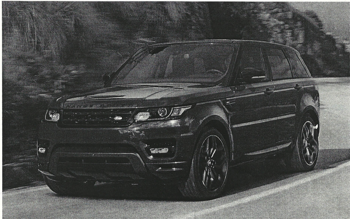
European vehicle shown with optional 22" wheels. ( 21" wheels are standard for the US Market)

Production Volume: 800 units for 2016 MY