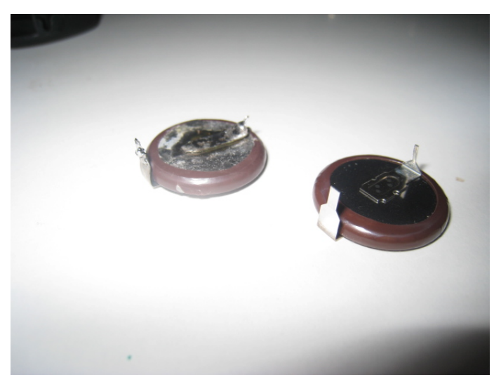
Old and new battery

The second thing you will need is a replacement battery. I bought the same one that I found in the fob. I used PANASONIC VL 2330 battery.