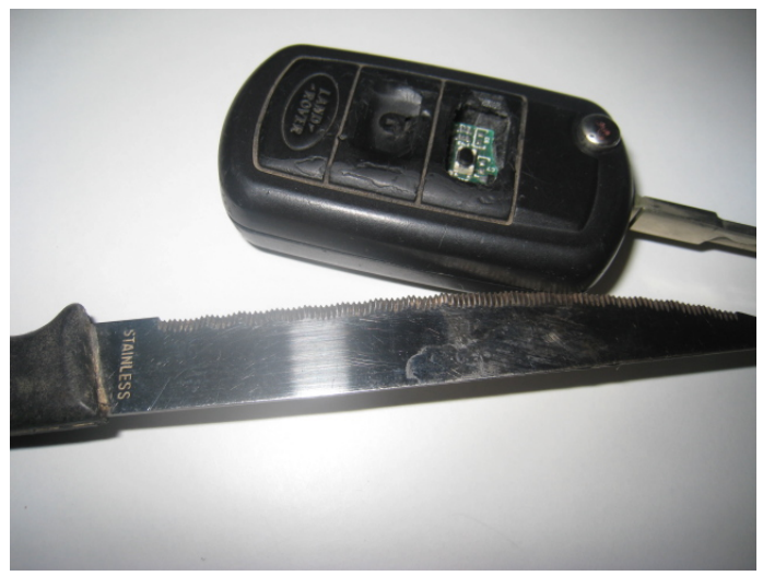
Cutting around the key fob

Put the old key fob on the flat surface. With use of the pizza knife gently saw all around the fob. The knife should run along the gap between upper and lower case shell. The blade should be opened (otherwise you will not be able to saw trough the blade well).