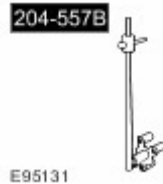
Gauge, Ride height 204-557B