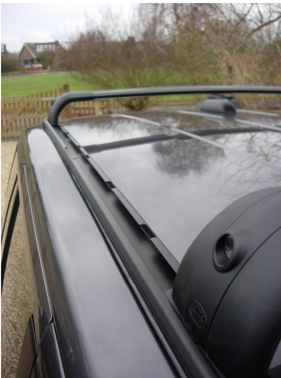
The finished job