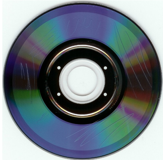
Figure 2 Dirt , finger prints, dust